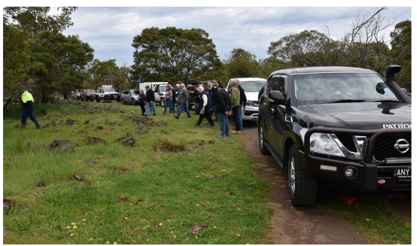
FWDV Regional Representatives looking at one of the many occupation sites on Gunditjmara land.