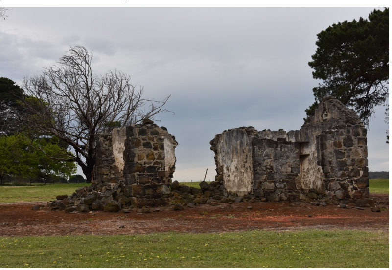
Ruins at the Lake Condah Mission site.

It was a long way to travel for the meeting, but the reward was two excellent and informative days.