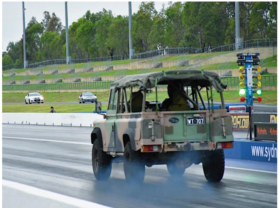
A Perentie sprinted the quarter mile in 19.812 seconds at the Sydney Motorsport Park drag meet.