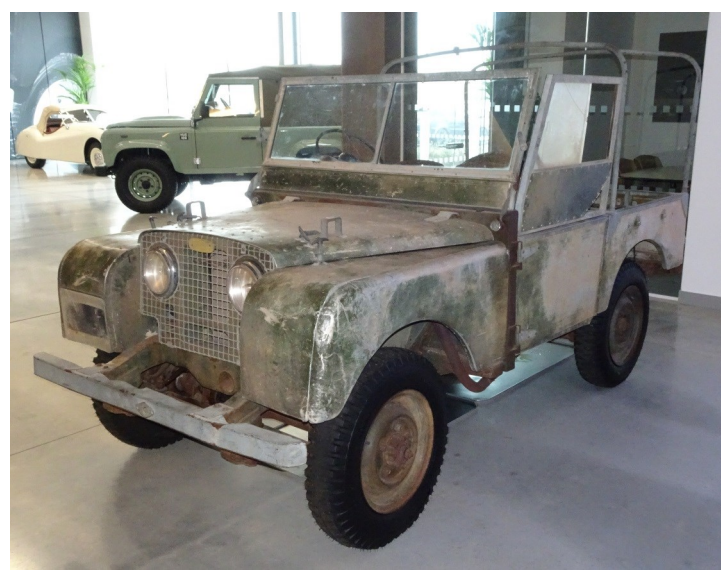
Well preserved Land Rover 80" from outback NSW (Bourke) now housed at JLR Classic Works, Coventry