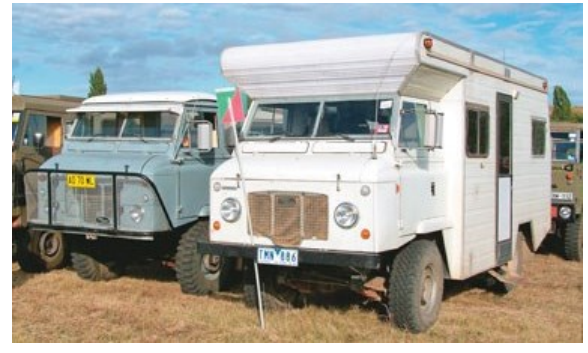
Some pictures from the 60<sup>th</sup> Anniversary of Land Rover at Cooma 2008