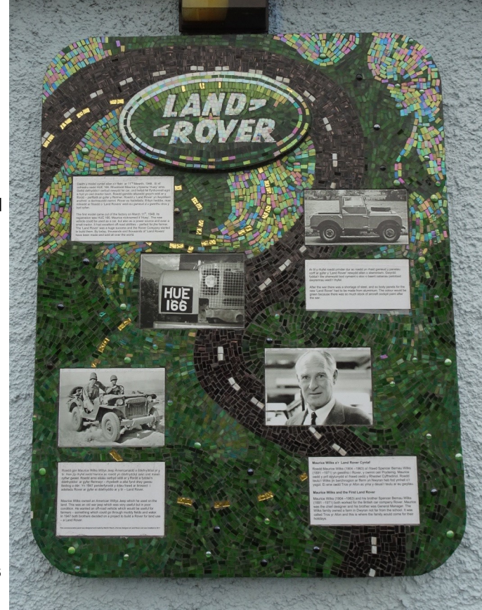
Land Rover mosaic tribute at Dwyran primary school

rallies or exhibitions, whilst also sourcing donor cars as the basis of their Reborn Legends programme. This offers factory