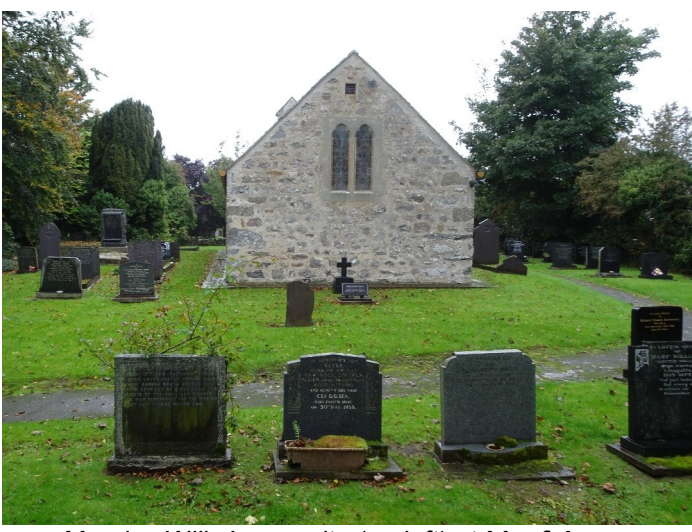
Maurice Wilks' gravesite (on left) at Llanfair-yn-y-Cwmwd (St Mary's Church), Dwyran, Anglesey

The following day saw Kellie and I arrive in Coventry for the Jaguar Land Rover Classic Works tour. Tours only officially began two weeks earlier at the start of September, after the Classic Works operation moved in to the purpose built £7 million facility in June. The formal business of restoring, maintaining and selling older vehicles was only established a year earlier, initially at the old Jaguar Browns Lane plant. They not only service and offer parts support to vehicles more than ten years out of production, but also maintain JLR's collection of historic vehicles, preparing them for various classic road