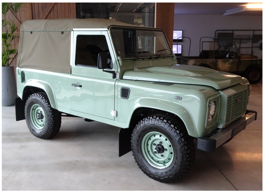
H166HUE - The last ever Defender produced in 2016 after 68 years

rebuilt examples of their greatest vehicles. So far Series One, Jaguar Etype and Range Rover Classic have or will be coming down scaled-down production lines. Greeting us in the foyer of the purpose built facility before the tour began were a number of classic Jaguars and Land Rovers. However, I was immediately drawn to a rather special Defender -H166HUE - a Heritage edition softtop 90 - the last ever Proper Land Rover made. Nearby was a very tidy 80" which still had traces of red dust on its paint bare panels - it looks if it had just driven from outback New South Wales and was here on holidays visiting the grandkids. Once our other tour guests arrived we departed in earnest. Our guide, a former Jaguar man who was quickly learning about everything Land Rover as well brought us through an imposing set of doors which revealed the most amazing workshop ever. Unfortunately once inside no photos can be taken so