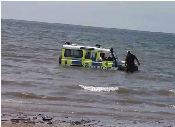
Is that the water Police ?