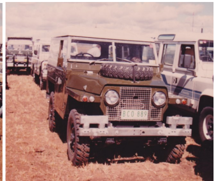
Seen at Cooma 1988; Top left, rare 80" Estate car, right, 2A Half Ton. Below left, Series 2 ex SMA fire fly, right, 2B tipper.