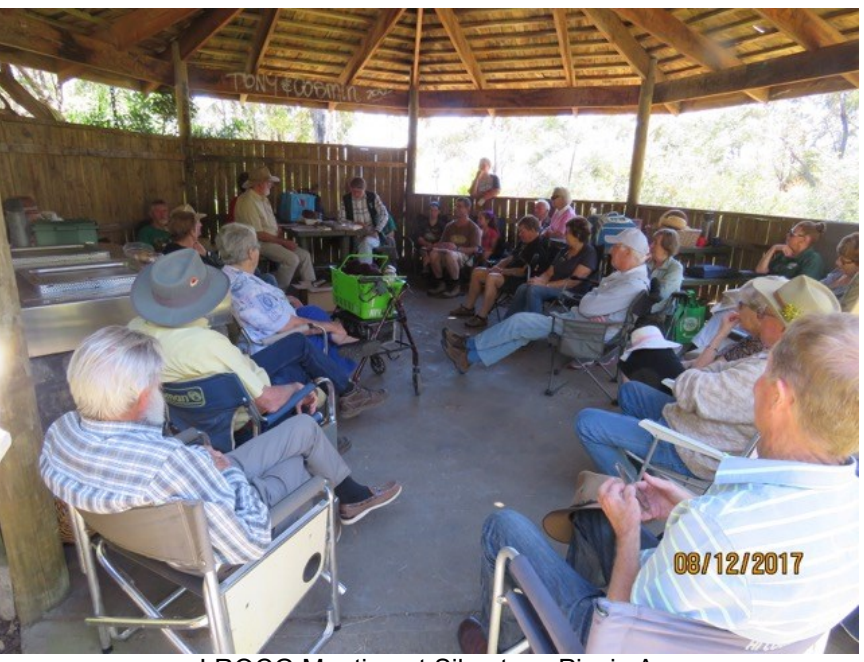
LROCG Meeting at Silvertops Picnic Area

3. Personal details forms should be carried on all club trips from now onwards. Trip leaders please collect and check. Sign on sheet for all trips. Visitors