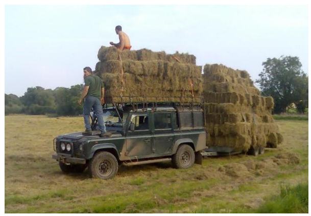
Hoody's been carting hay

Greg advised first aid for snake bite guidelines have been updated to ensure victim be kept as still as possible and advised gators and leather gloves are always highly advised. Also noted that the bite area should NOT be wiped clean. Motion moved by Greg Rose, that the club purchase an updated snake bite kit which incorporates 2 compression bandages, at a