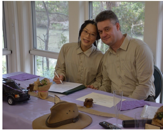
The happy couple dressed for the service; walking boots, gaiters, bush shirts and pants & Acubra hats. The Wedding rings, which they made for each other, arrived on the back of a remote control Land Rover Discovery.