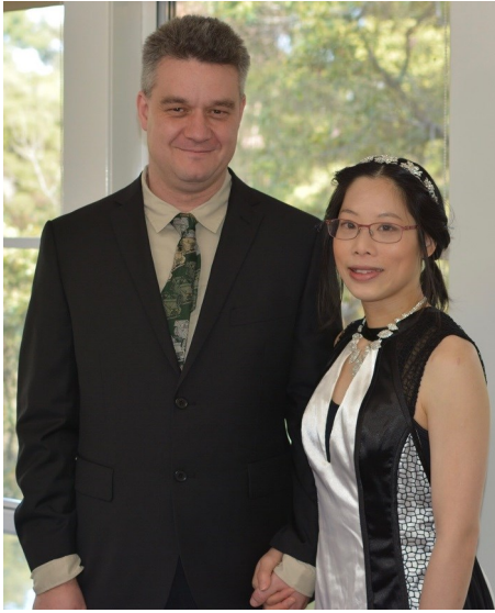
The happy couple before the service.