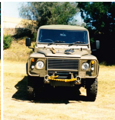
Initial Production Vehicle number 3; Truck, Utility, Lightweight, FFR, Winch, MC2, Land Rover. pictured in February 1987.

Initial Production vehicle 48-002 and 48-003 were the development vehicles for what became the RFSV, prototypes in essence. They were utilised as hacks and were left out in the sun for a number of years. In the end they were converted to the later RFSV standard and returned to regular service, making them fairly unique vehicles to have existed in three distinct configurations.