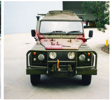
48-003 taken at Rover Australia, Rosehill in 1998/99.