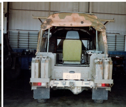
48 003 at Port Darwin Motors in late 1990 or 1991