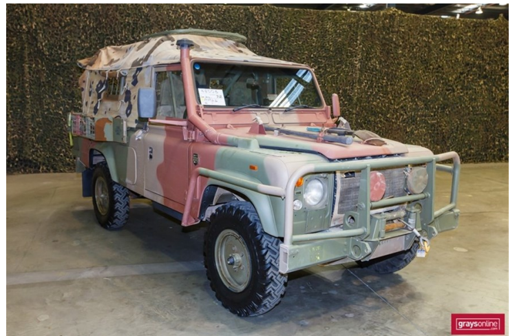
48 003 as it went through the auctions last month