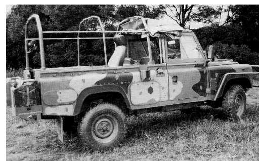
48-002 & 48 003 at LRA Moorebank shortly after conversion from FFR. Taken on the 26/07/1990.

Officially the Truck, Surveillance, Lightweight, Winch, MC2, Land Rover, built under Project Perentie. This vehicle was built to traverse the most inhospitable parts of Northern Australia. The vehicle is a ruggedised version of the basic soft-top derivative with additional stowage facilities for stores and equipment. A number of features such as increased vehicle protection, modified rollover protection system, heavy duty split rims, extra fuel storage and spare tyres were included to make those crewing these vehicles as self sufficient as possible. This version is intended to carry up to 1200kg of payload, with a driver and 2 passengers for prolonged periods of time whilst on patrol. Some applications will require the towing of a trailer up to 900kg mass.