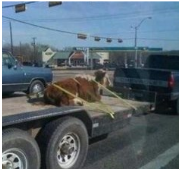
Hoody's Livestock Transport

Held over until next meeting. Come with ideas.