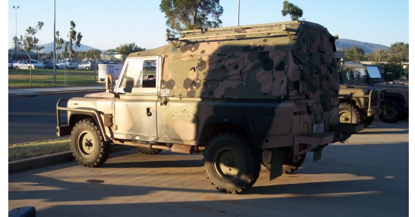
48 003 at Bandiana after going through the line and being brought back to original RFSV build configuration on 24/03/2006