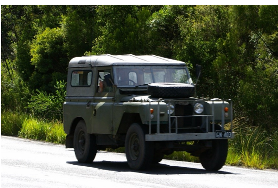
A couple of pictures from this years "Haulin' the Hume"