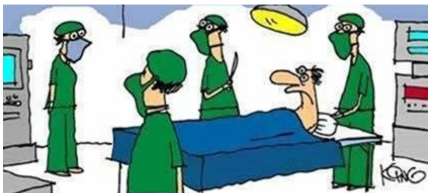
"Nurse, get on the internet, go to SURGERY.COM, scroll down and click on the 'Are you totally lost?' icon"