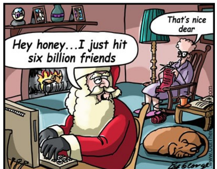
Santa on Facebook